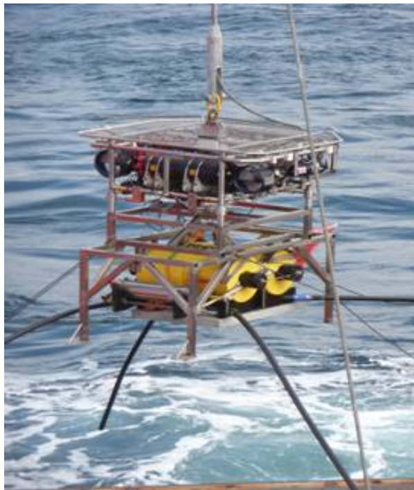
HyBIS Robotic Underwater Vehicle with Geomar's OBS/OBEM Deployment Module